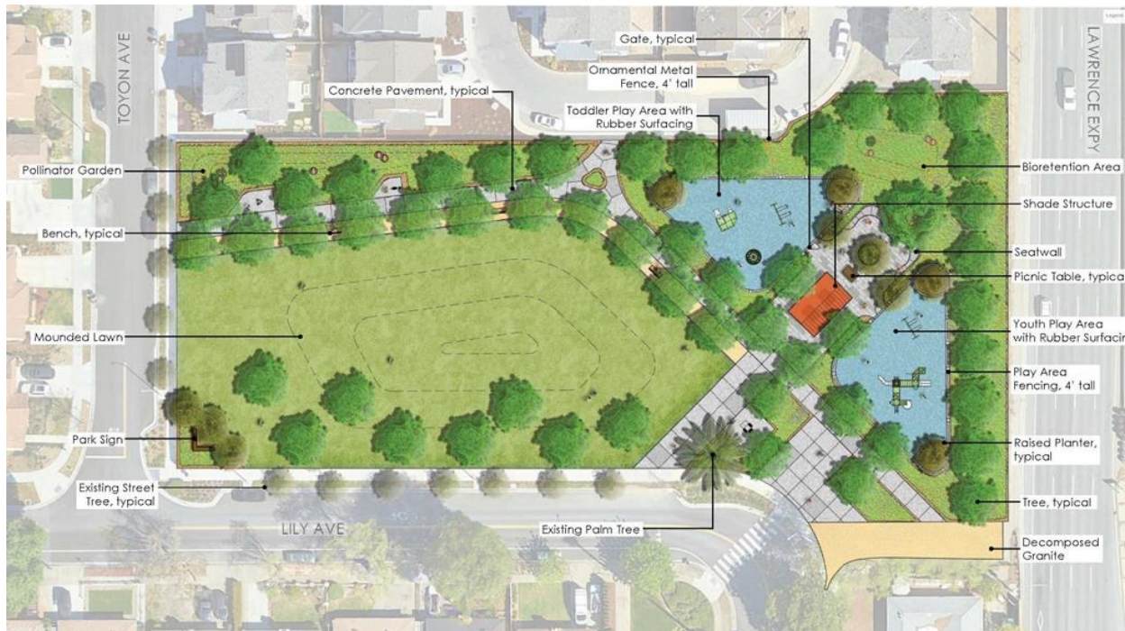
Image: Corn Palace Park, Approved Concept Design Plan

The City of Sunnyvale's Art in Public Places program seeks to commission artists, or artistic teams, to design and execute original works of art for the new Corn Palace Park. There are four opportunities for art for this project: three backless artist created benches and a mosaic seating wall.