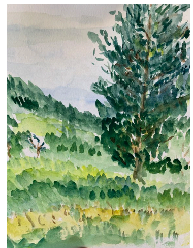
Sue Mendehlon, 2019

Transportation: The resident must have a vehicle due to the remote nature of the location. It's recommended that vehicle should have high clearance or 4-wheel drive to travel on backcountry roads, but not required. Please evaluate your comfort level and ability to operate under remote conditions before venturing out to backcountry roads or trails. The BLM can provide you with maps and information for hiking the Lost Coast