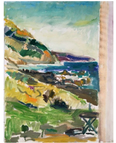
Robert Poplack, 2020

Art supplies & materials: It is advised that the artist brings all required art supplies. There is a small shop in Garberville and one in Eureka that carry art supplies, however its best to use those shops as a back-up. Workshop materials are provided by the AIR program and a list of needed materials must be presented to BLM with ample time for online ordering. For the gallery show, frames are required and will be provided by artist (dependent on the type of artwork).